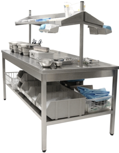
Preparation and Packing Table - double post 2000 x 850 x 900mm

The Preparation and Packing Tables are specially developed for the sterilization rooms.