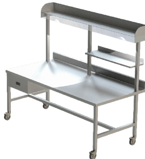
Preparation and Packing Table - simple post 1500 x 700 x 900mm

Due to product improvement and development, PROHS reserves the right to make changes without notice.