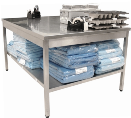
Preparation and Packing Table - simple 2000 x 1000 x 900mm

Can be produced in different dimensions.