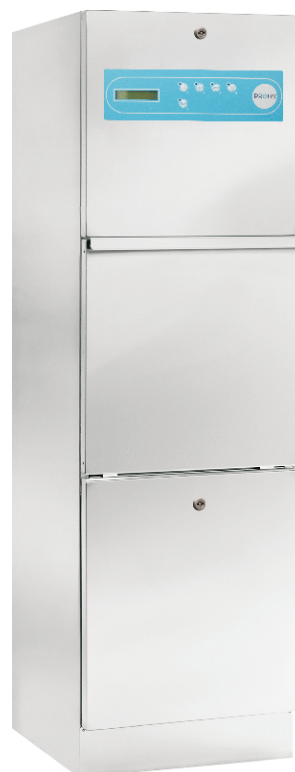
Dim. (WxDxH mm): 450x500x1500

Small basket that allows the washing and disinfection of utensils.