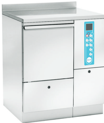
Dim. (WxDxH mm): 750x600x850