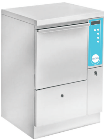
Dim. (WxDxH mm): 600x600x900