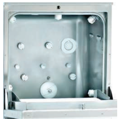
Chamber - Detailed View